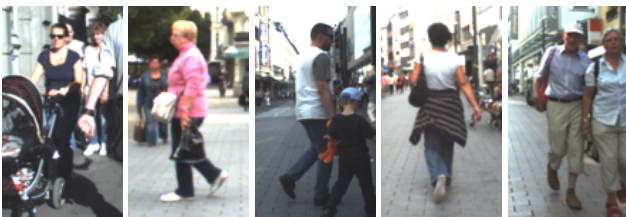
Figure 3. Examples from our new PARSE-27k dataset — We aim at a large well-aligned yet diverse dataset of pedestrians in realistic scenarios.

or face shots. In addition the datasets follow a random split routine, which leads to a few closely related training and test examples. Recently, the CPR dataset [9] with a similar size but only four attributes has been published.