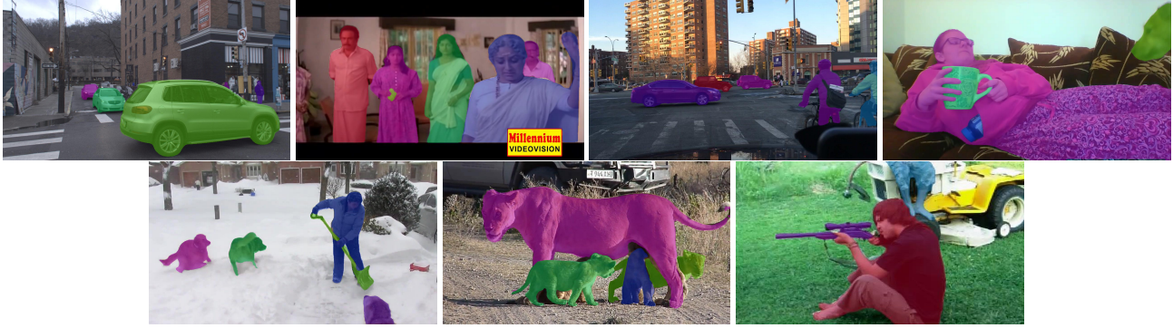
Figure 2. Example annotations of the TAO-VOS training set. We show one frame of one example sequence for each sub-dataset.