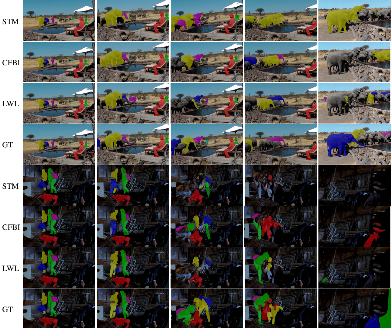
Figure 4. Qualitative results on the TAO-VOS validation set. Here we compare STM-VOS [27], CFBI [40], LWL [12], and the ground truth (GT). For the two considered hard sequences from TAO-VOS, all considered VOS methods fail to segment the objects accurately after some time.

very hard with many objects and that all three considered methods lose track of all objects after some time. Again, this highlights that TAO-VOS as a benchmark has strong potential to enable further progress in VOS.