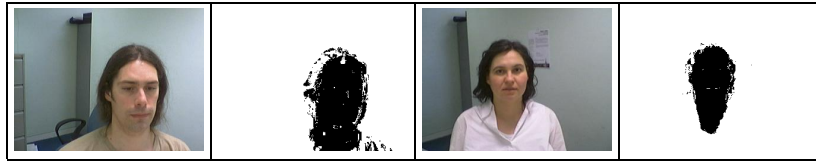
Figure 2: Skin coloured pixels classified using a HSV histogram

This feature detector is based on a binary image formed using a colour histogram constructed from skin coloured patches. It has been widely observed (see for example [11]) that pixels relating to skin form a compact region in colourspace, in particular in the normalised HSV (Hue-Saturation-Value) colourspace we use. It should be noted that colour values with particularly high or low brightness (V) values provide unreliable colour information and are discarded in the training phase. Pixels are classified as skin colour if the probability of the histogram bin relating to the pixel colour is greater than a threshold value.